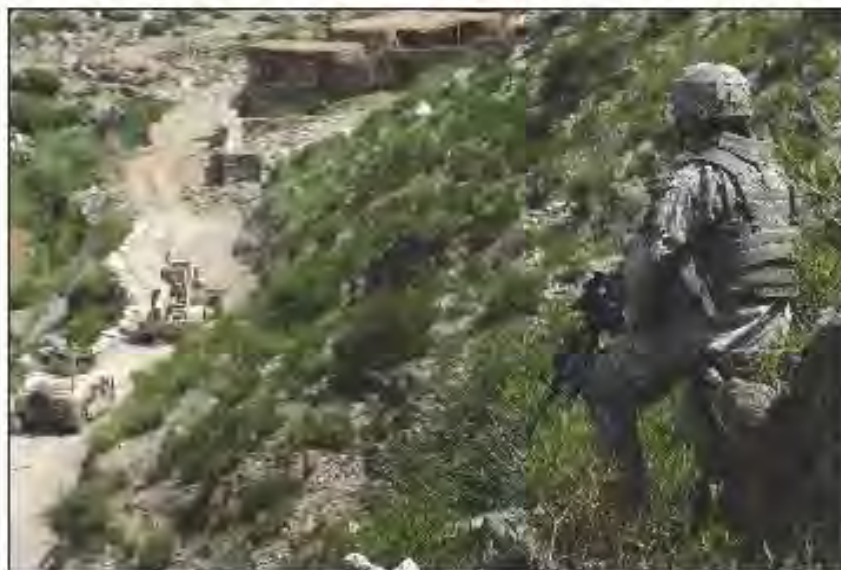
Sky Soldiers remaining vigilant while pulling security